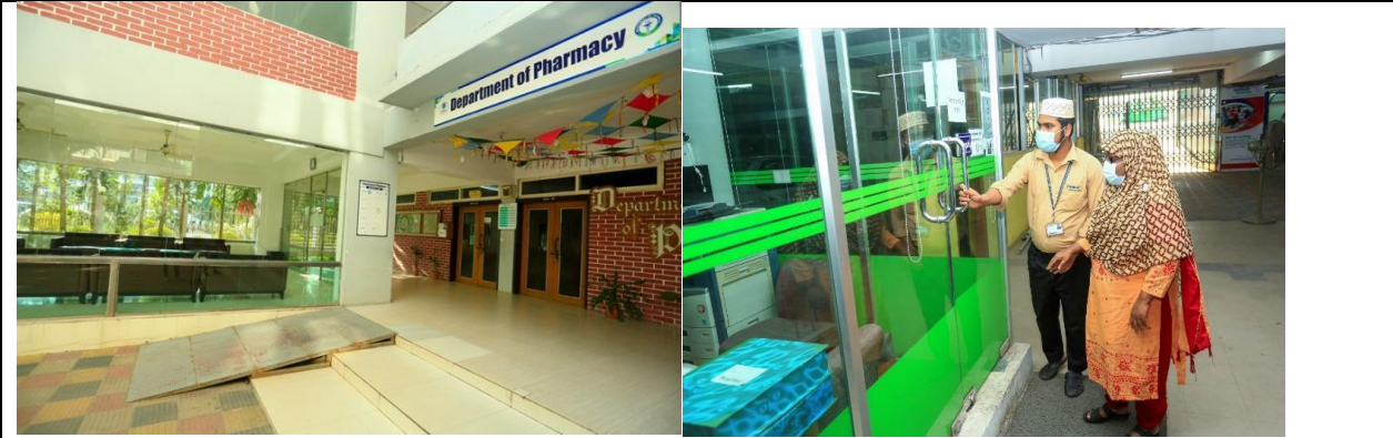
Support services for Physically challenged People in campus